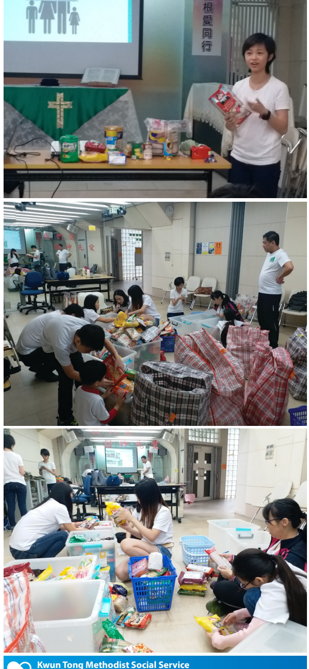
Kwun Tong Methodist Social Service 循道衛理觀塘社會服務處

昊天義工隊協助「食物銀行」將收集得來的食物進行分類 及登記,以方便有需要的人士前來領取。